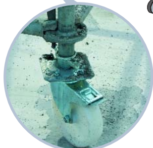
WHEELS WITH BRAKES (height adjustable)