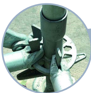
CONNECTION USING MULTIDIRECTIONAL ROSETTE

The Alsina access ladder, with 1.57 x 2.57 m base, has various sections allowing access to even and uneven height ranges, braced to structural elements.