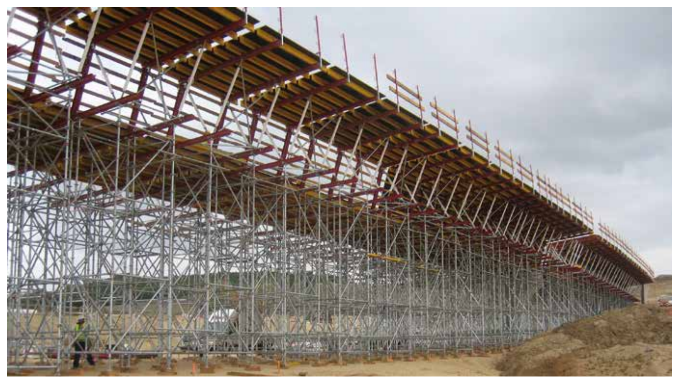
Road in Burgos, Spain

Multiform is a highly versatile system that adapts to a wide range of geometrical shapes for the construction of: Bridge decks, large thickness slabs and headers or platforms, bridges, underpasses and overpasses. A modular system consisting of elements that couple together easily and adapt to a variety of geometrical shapes due to their flexible configuration prepared by the corresponding technical study. If a board requires elevations, drops or forms a curve, the Multiform system provides these with great ease. All the elements of the Multiform Horizontal system have been designed to resist job condition and provide a long service life.