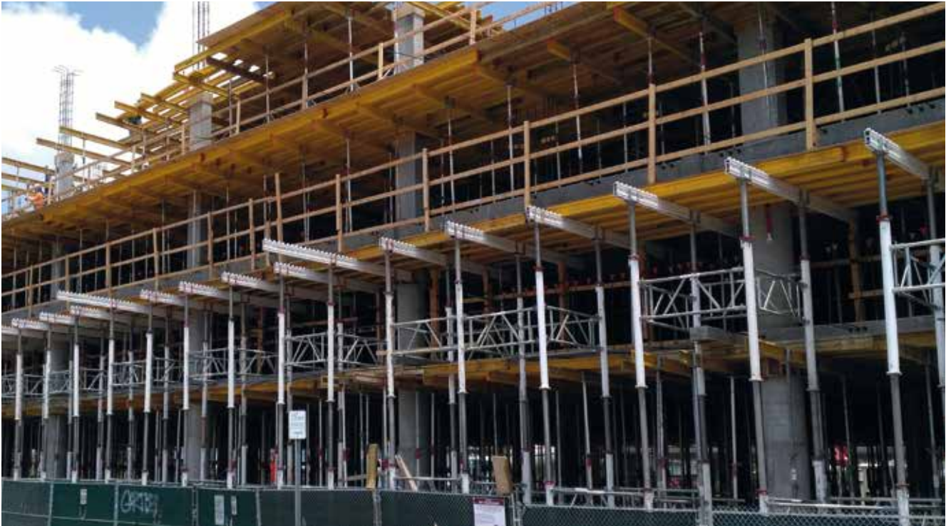
St. John's Plaza in Downtown Miami, United States

The A-lite Post-shore is Alsina's new telescopic shoring system. It is made of aluminium and is both lightweight and strong. The A-lite Post-shore can be used as an independent support post-shore, or as part of a loading tower. The so-called bracing frame accessory has been designed to brace the A-Lite post-shores, and safely and quickly assemble independent loading towers. It has been designed and manufactured in compliance with the EN 16031 standard.