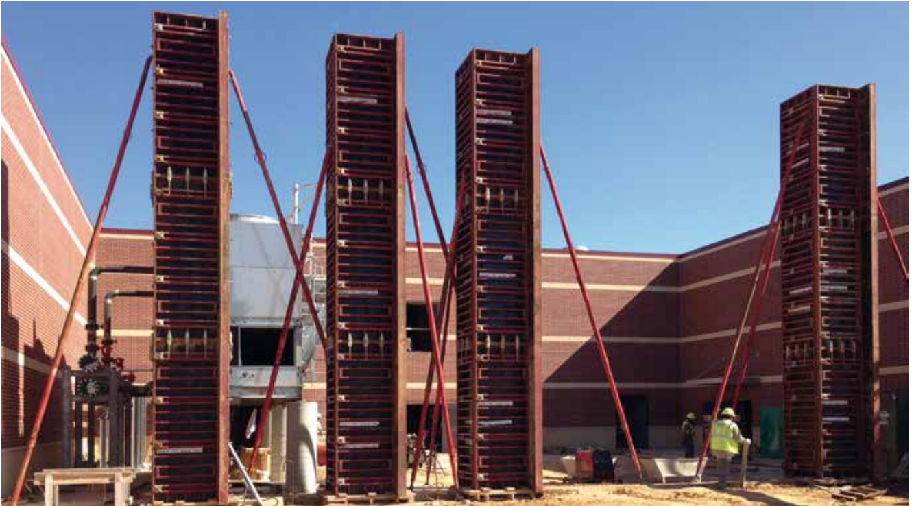
Flex 14 Theater in Texas, United States

Column adjustment system for large sections. Reusable formwork system for adjustment columns designed to be handled with a crane. The Alisply Universal System forms the column with a fair-faced concrete finish, ideal for creating large sections up to 48" (120 cm). The Universal Panel has the same characteristics as the Alisply Panel but with one important difference: their cross beams are reinforced and adjusted to be able to create columns adjustable on four sides.