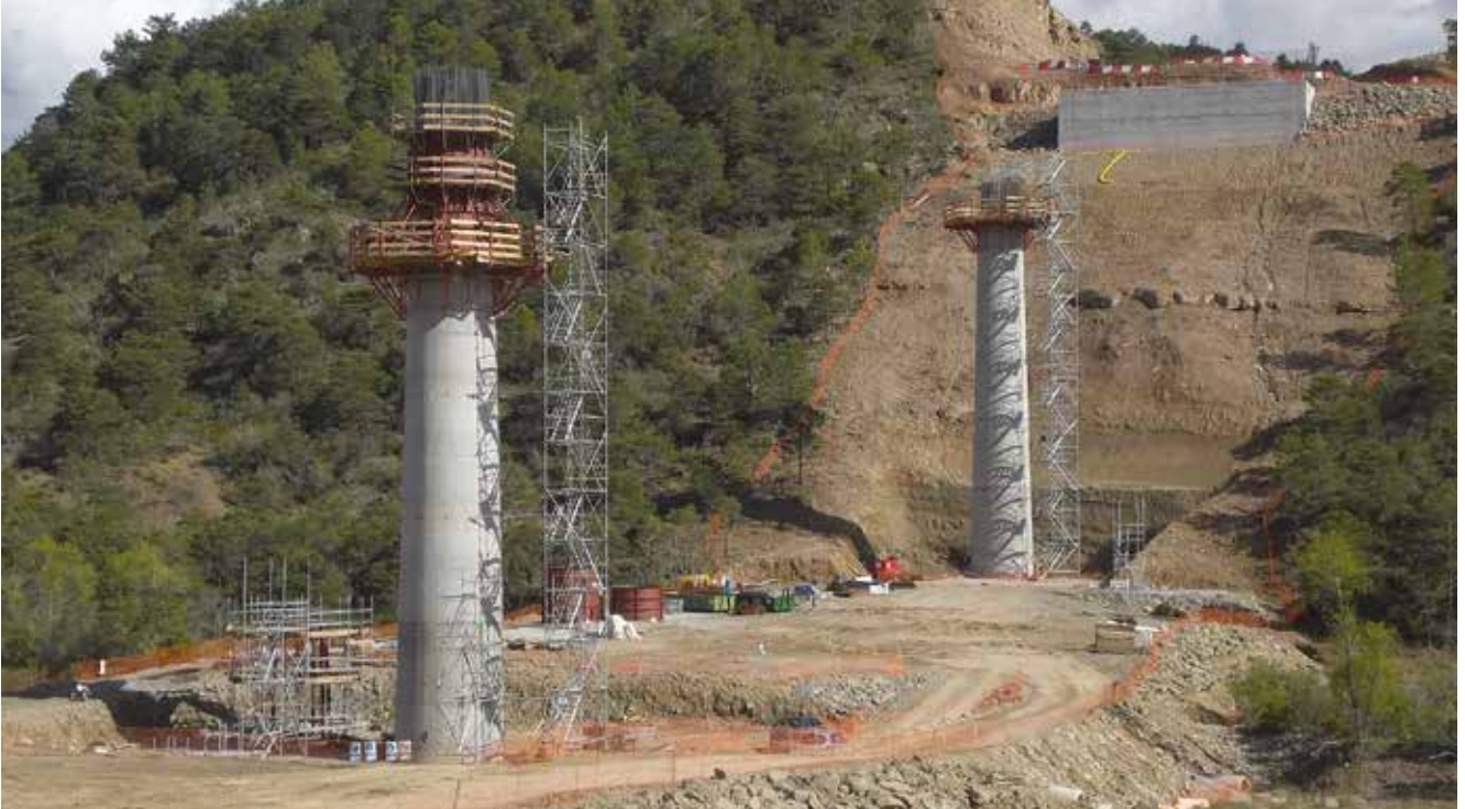
A-23 Highway Caldearenas - Lanave, Spain

A system for the forming of cylindrical piles consisting of half-round metal panels. The Alisply Metal Piles system allows for the creation of round pillars or moduled pillars with semicircular ends. Likewise, when the Alisply profile is on the ends, the joints are made with the GR-2 Clamp. This characteristic makes it totally compatible with the Alisply range of products and offers quick and easy assembly.