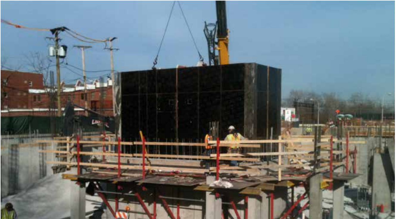
Lakepark Crescent residential in Chicago, United States

A system designed for safe performance of: interior climbing systems in hollow pier formwork, elevator shaft formwork and all types of hollow structures with multiple sections. The design principle of the Interior Climbing System is simplicity: it is very easy to assemble, without the need for tools and it can be moved quickly and easily.