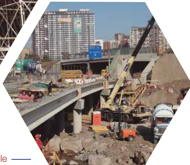
Underpass in Santiago, Chile —