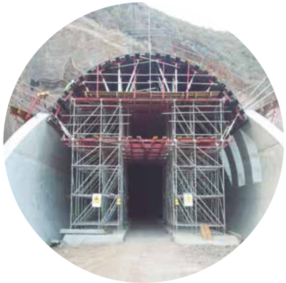
El Bicho Cut and Cover Tunnel, Spain