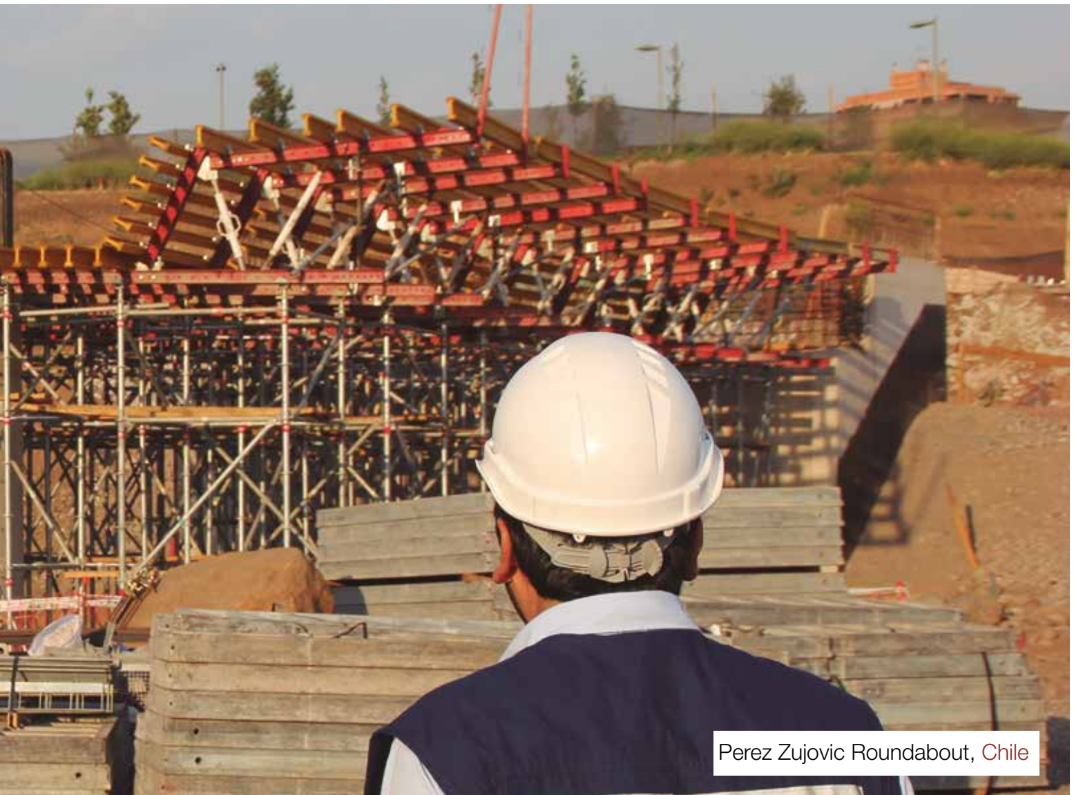
Perez Zujovic Roundabout, Chile