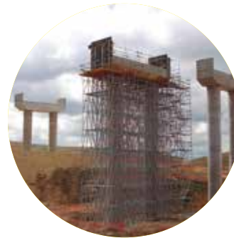
Civil works systems and solutions