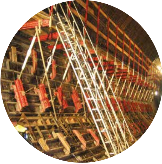
Pajares Tunnel, Spain