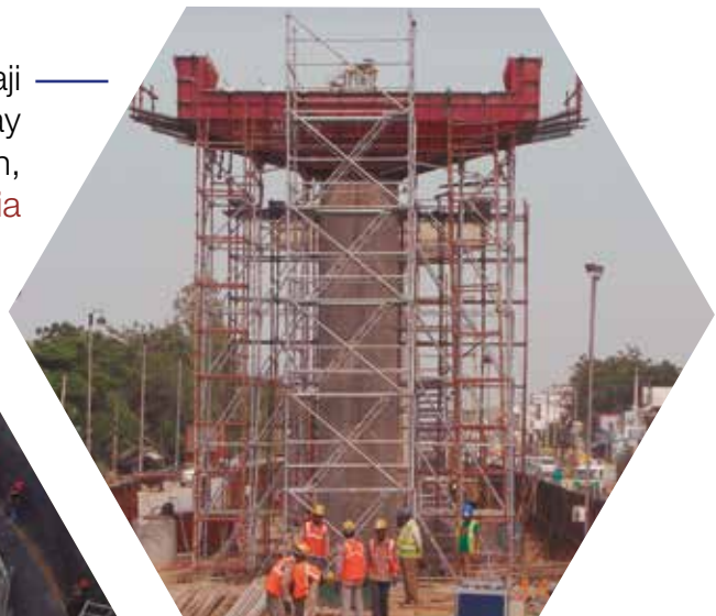
Kalkaji Subway Station, India