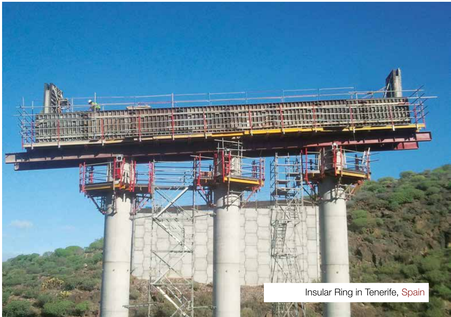
Insular Ring in Tenerife, Spain