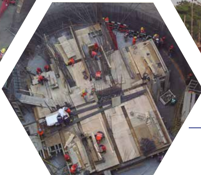
— Cementerios Subway Station, Chile