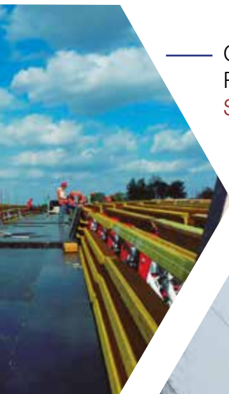
— Castejon Railway, Spain