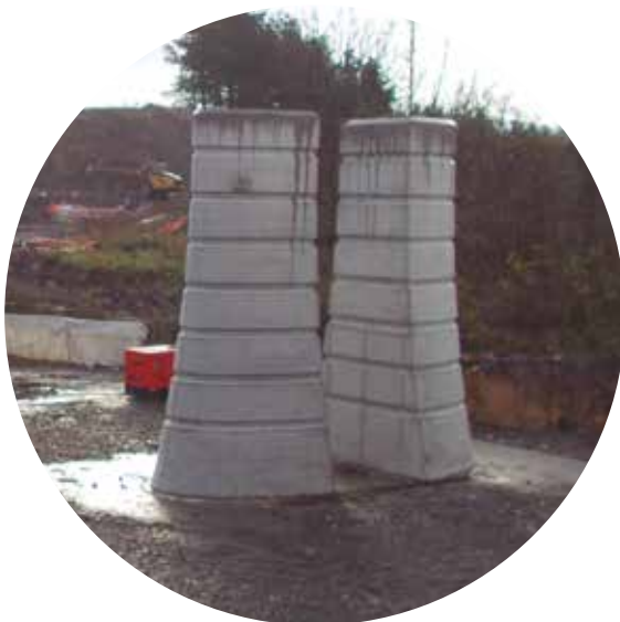
Elorrio Bypass, Spain