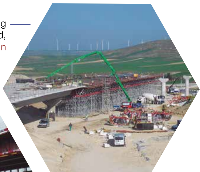
Burgos Ring Road, Spain —