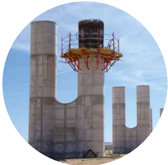
Alpera Railway, Spain