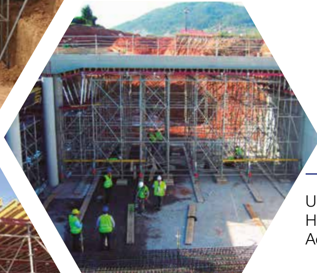
University Hospital Access, Spain