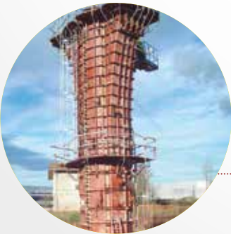
Straight and radius wall solutions, both crane-set and hand-set