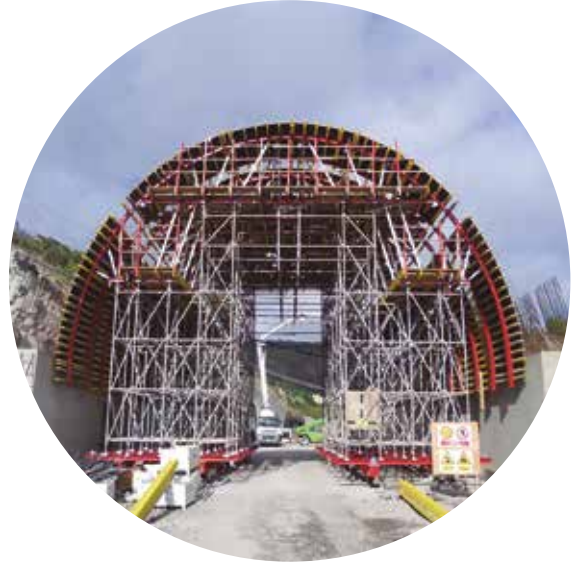
El Tanque Cut and Cover Tunnel, Spain