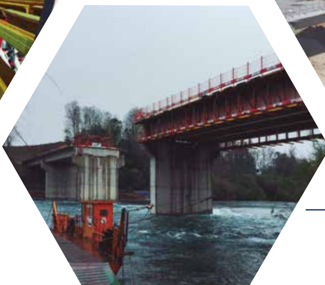
— Ranco Lake Bridge, Chile