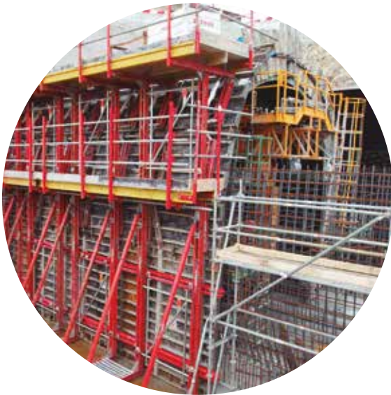
A Canda Tunnel Entrance, Spain