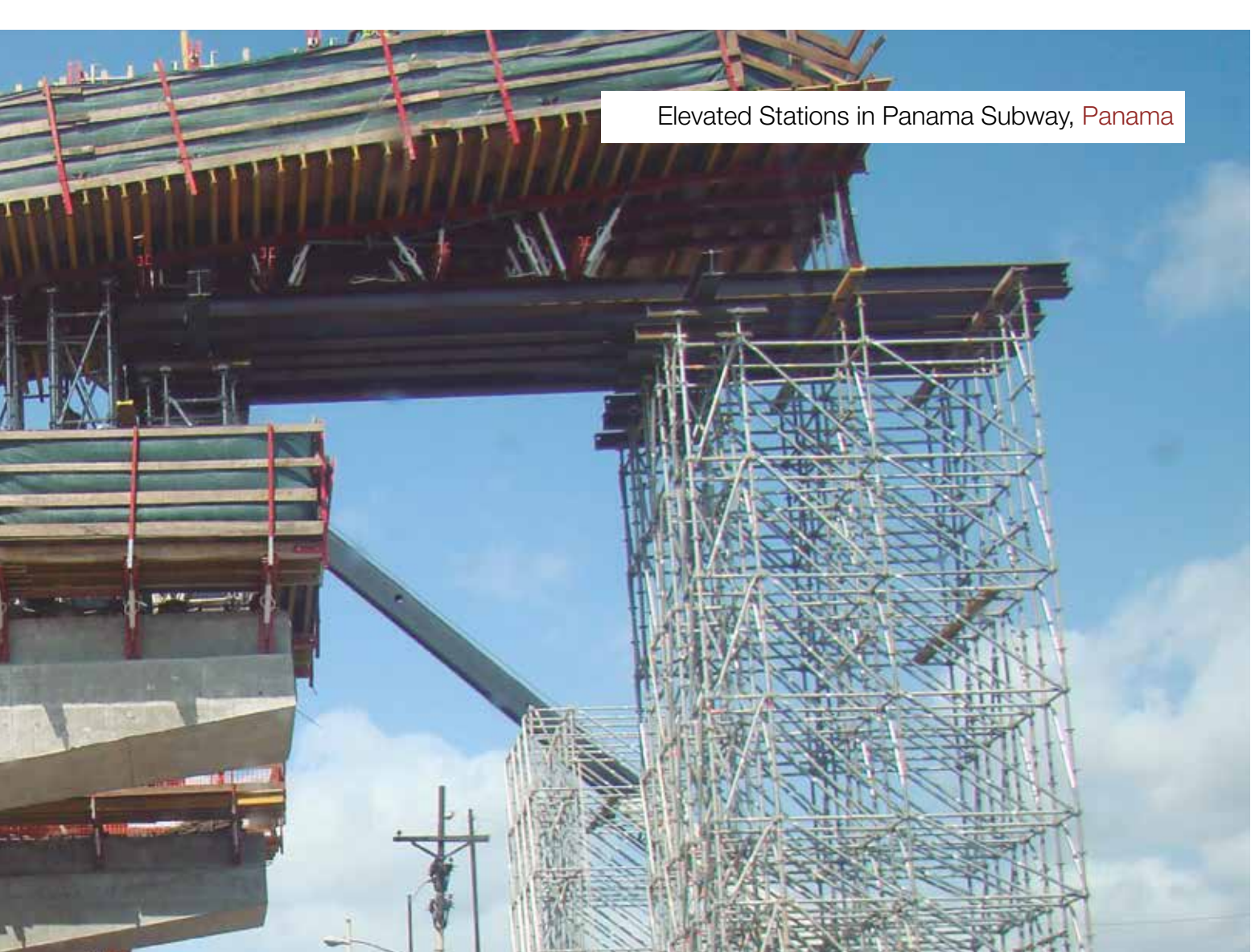
Elevated Stations in Panama Subway, Panama