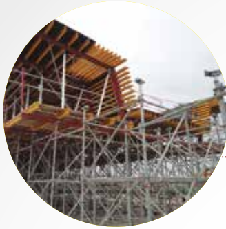
Comprehensive Technical and Logistics Service