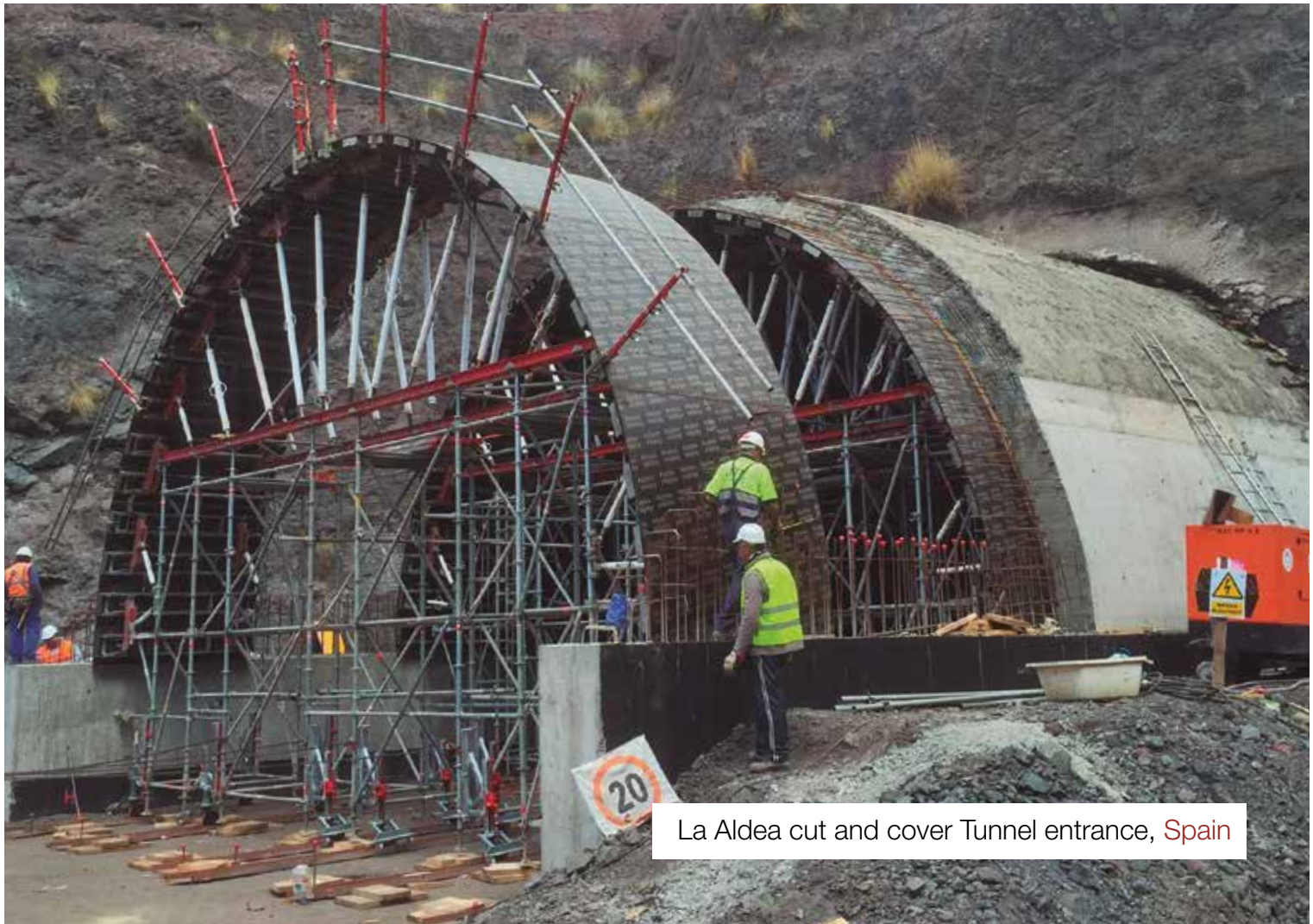
La Aldea cut and cover Tunnel entrance, Spain