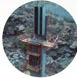
Climbing systems, safe and reliable