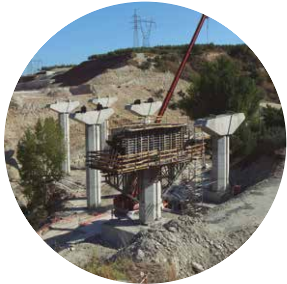
Cocentaina Carriageway, Spain