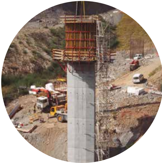
Sarria Bypass, Spain

Backed up by more than 15 years of international experience in Civil engineering around the world, Alsina has supplied its wide range of formwork solutions for transportation projects such as the A23 Highway or the Viaduct 7 of the insular ring in Tenerife (Spain) among many others.