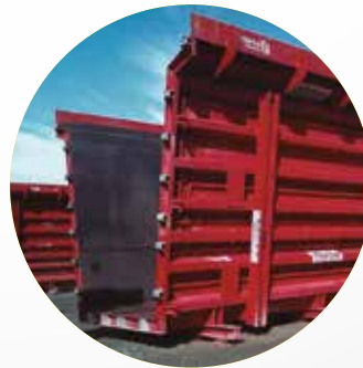
Special Forms and Systems