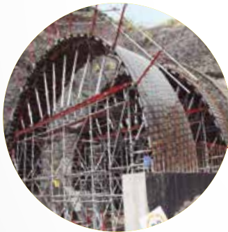
Cut and Cover Tunnels Solutions