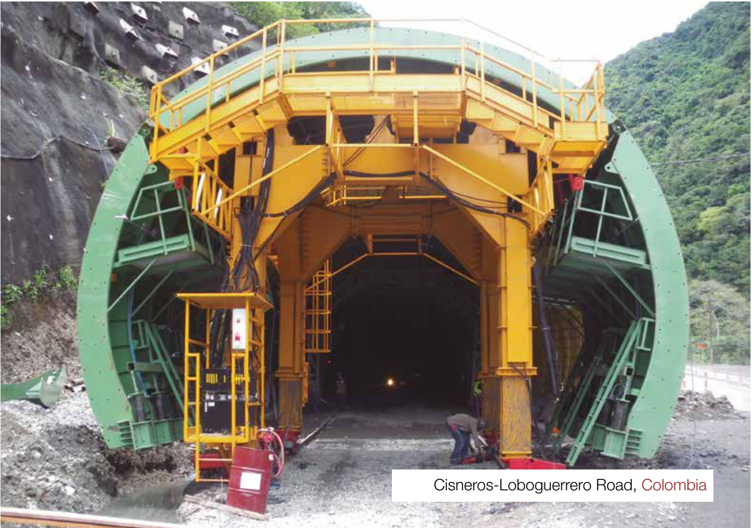
Cisneros-Loboguerrero Road, Colombia