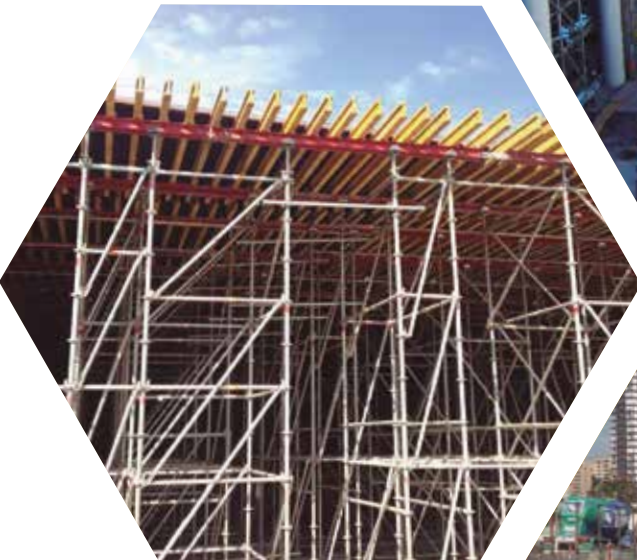
Casablanca — Underpass, Morocco