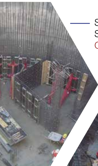
— Simon Bolivar Subway Station, Chile