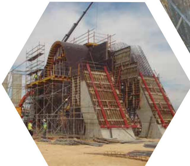
Alpera Railway, Spain

We offer a wide range of formwork solutions to solve this type of projects, which, along with our reliable supply chain ensuring formwork delivery according to each constructive work phase, has allowed us to participate in very diverse railway projects around the world, such as the rehabilitation of a historic railway in Romania, the construction of the Casa Kenitra railway in Morocco or several AVE sections in Spain, among many others.