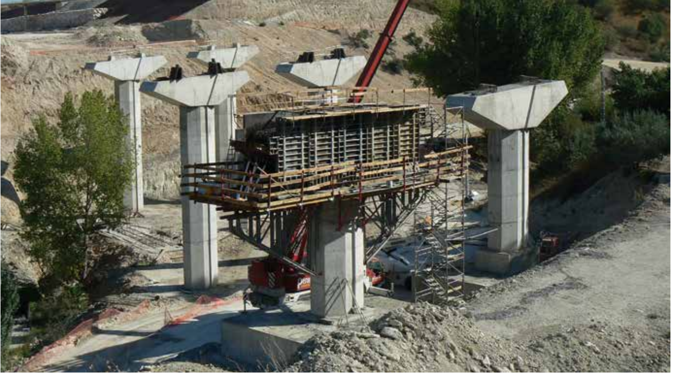
MU-31 highway, Spain

Alsina has developed a bridge pier formwork system called SCAP (High Performance Bridge Pier System). The system solves bridge pier construction, providing productivity and complete safety. The use of SCAP avoids the need for scaffolding support and is therefore especially useful in bridge piers seated on uneven terrain. In addition, this feature greatly facilitates formwork release using sliding wedges and reduces multiple repetition of movements.