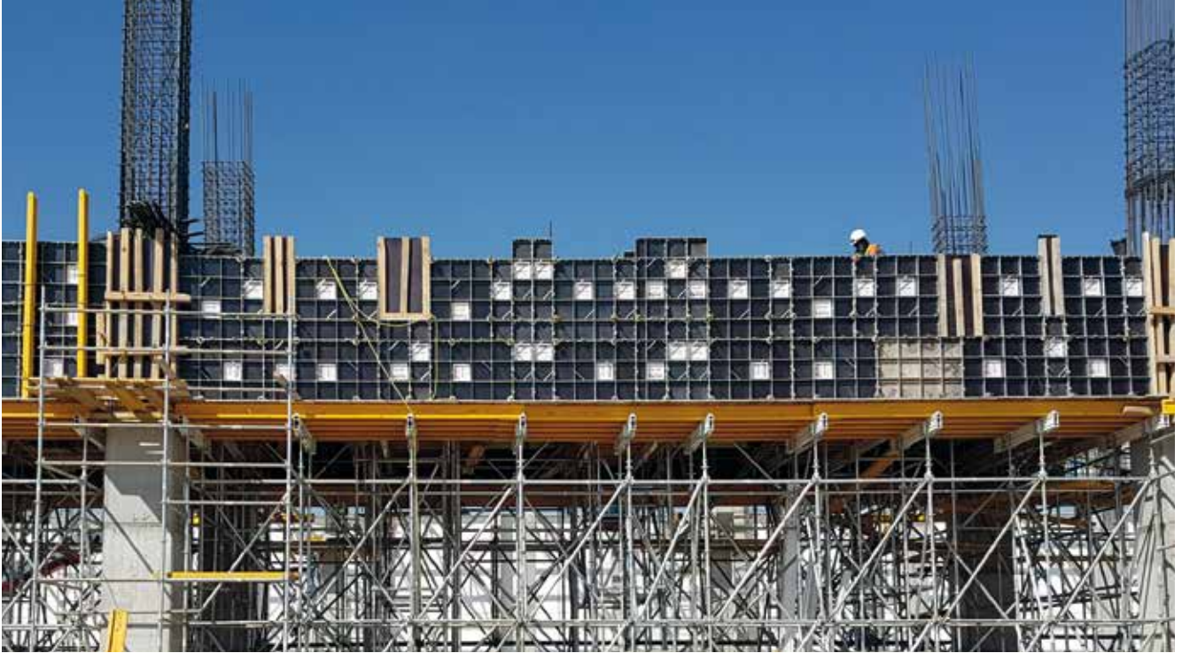
Automobile production plant in Jalisco, Mexico

Very versatile light formwork for walls adaptable to any geometry. The system is quick joining, which makes for high-productivity assembly. With just four panel widths, a unique corner and a few easily installed accessories, it is possible to adapt to any geometry.