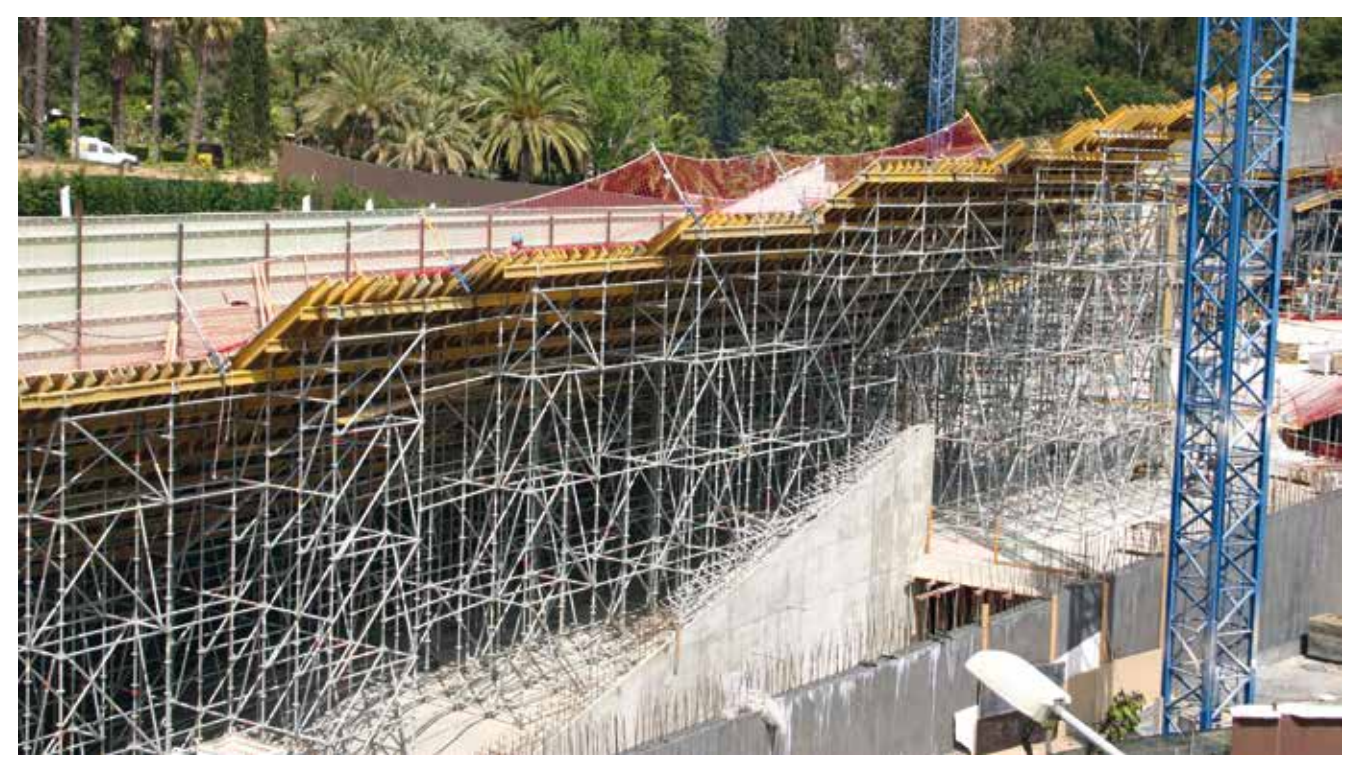
Lloret de Mar Casino, Spain

A multidirectional support structure for slab formwork. The system features light weight, easy component assembly and bearing capacity of up to 8992 lbf (40 kN) per support, making it an extremely useful element for the support of slab formwork, whether by means of independent towers or fixed scaffolding, depending on application requirements. The system is based on a scaffold with multidirectional connections used by a vast number of construction professionals.