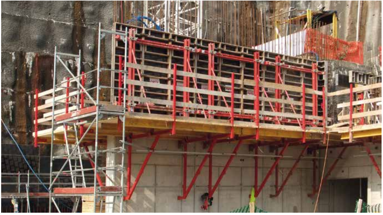
Cultural Center in Lugano, Switzerland

The climbing platform C-240 system allows piles and walls of climbing cycles with pouring heights of up to 19'-8 1/4" (6 m) to be formed with total safety for the laborers. It can be positioned with two anchorage systems: using M-24 ties bars or using Metal cones with ties set in the concrete. It can be set using either Alisply (straight and radius walls) and Vertical Multiform.