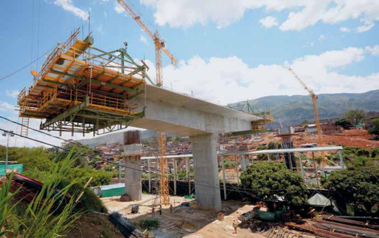
Madre Laura bridge, Colombia