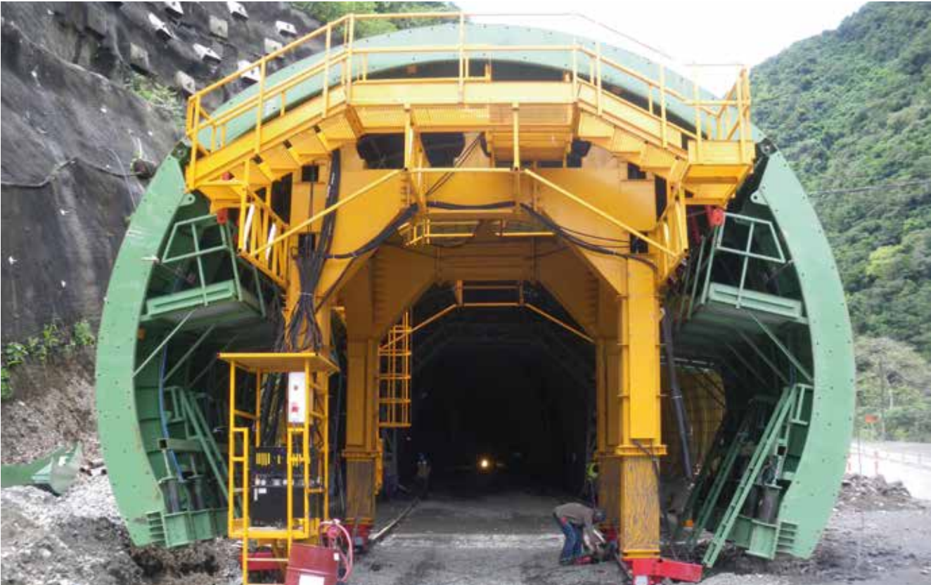
Cisneros - Loboguerrero tunnel, Colombia